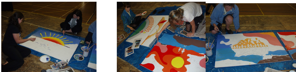
Pictured above are the Year 10 students working on the mural panels in the MPC on 17 th June.

When completed, the brightly coloured murals will be installed in a highly visible position on one of the school buildings for all to enjoy. The use of exterior house paint will ensure their colour and brightness will last for many years to come.