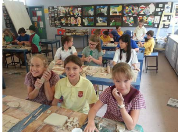
Some of the Students enjoying the day.