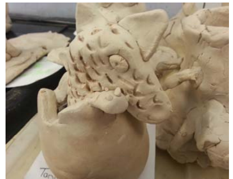
Some of the imaginative clay work produced.