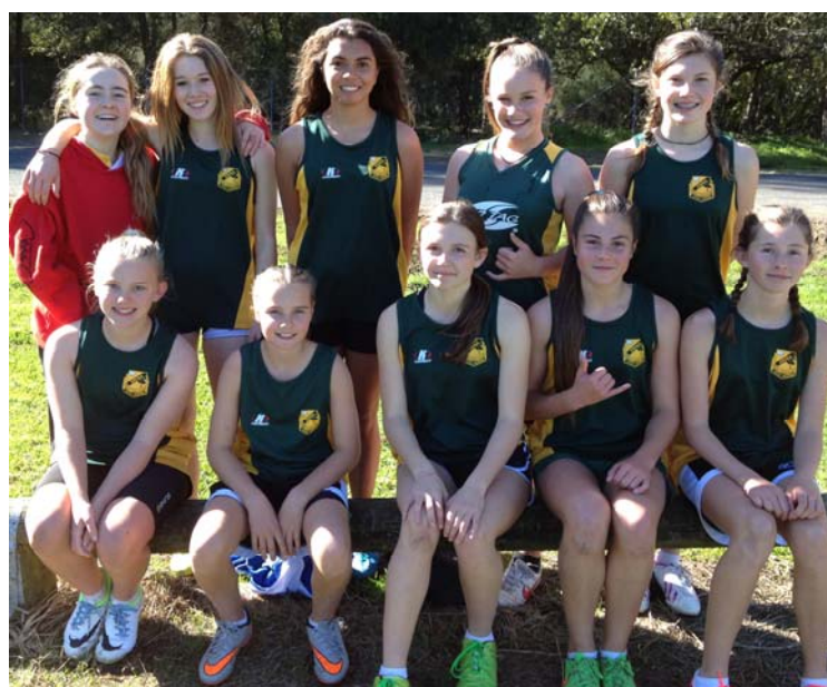
Year 7/8 Girls Touch Football Team