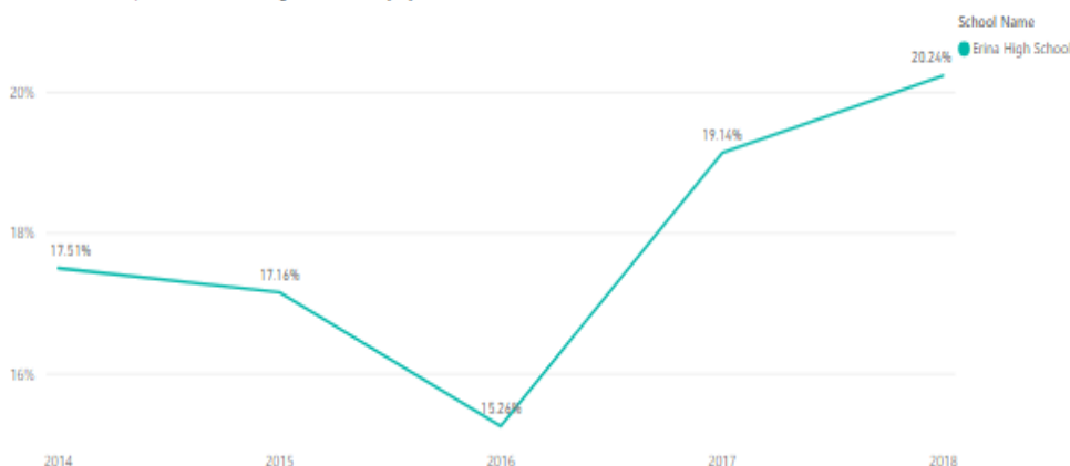
Average % Results in Top 2 Bands