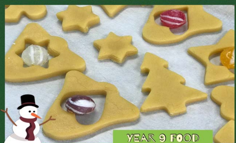
YEAR 9 FOOD TECHNOLOGY