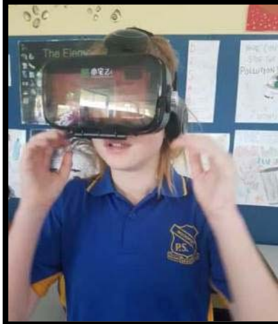
Students had an opportunity to enter the EHS Virtual Reality world where they had little challenges meeting people along the way who will help them with their transition to high school.