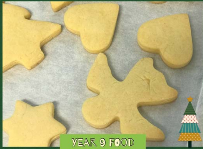
YEAR 9 FOOD TECHNOLOGY