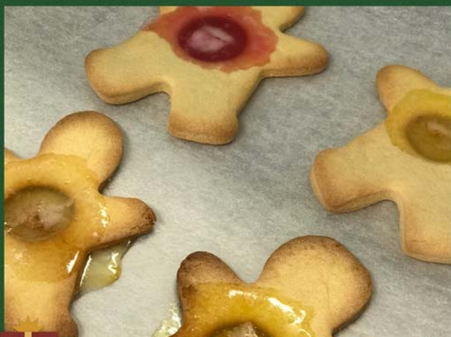
YEAR 9 FOOD TECHNOLOGY