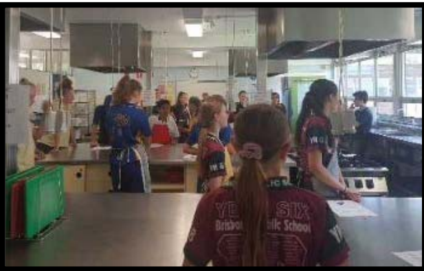
Students explored health and safety in the kitchen whilst making a yummy sour sherbet.