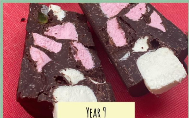
Left Year 9 Rocky Road Christmas Trees