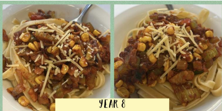
YEAR 8 TECHNOLOGY MANDATORY