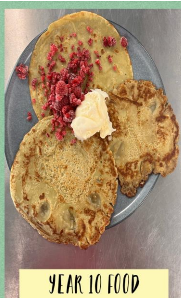
YEAR 10 FOOD TECHNOLOGY 'MATCHA CREPES'